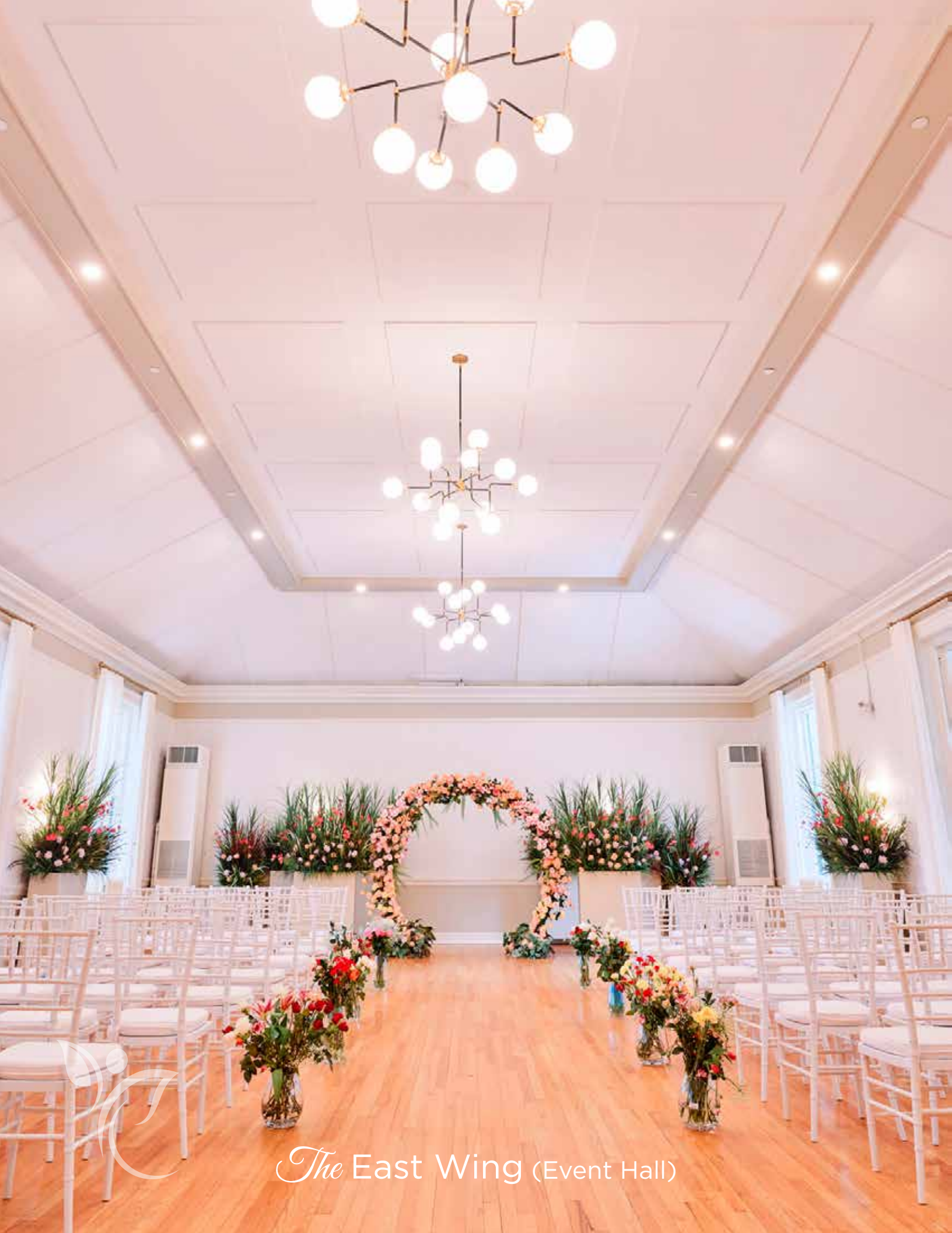
The East Wing (Event Hall)