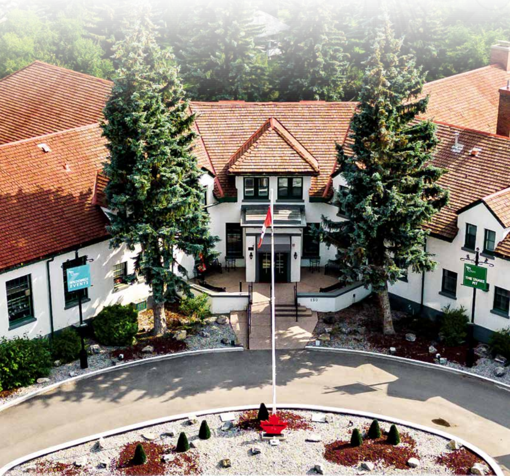
THE INN ON OFFICERS' GARDEN

This fully renovated boutique hotel is a historic heritage building with the exceptional craftsmanship of the past incorporated into the workmanship of today.